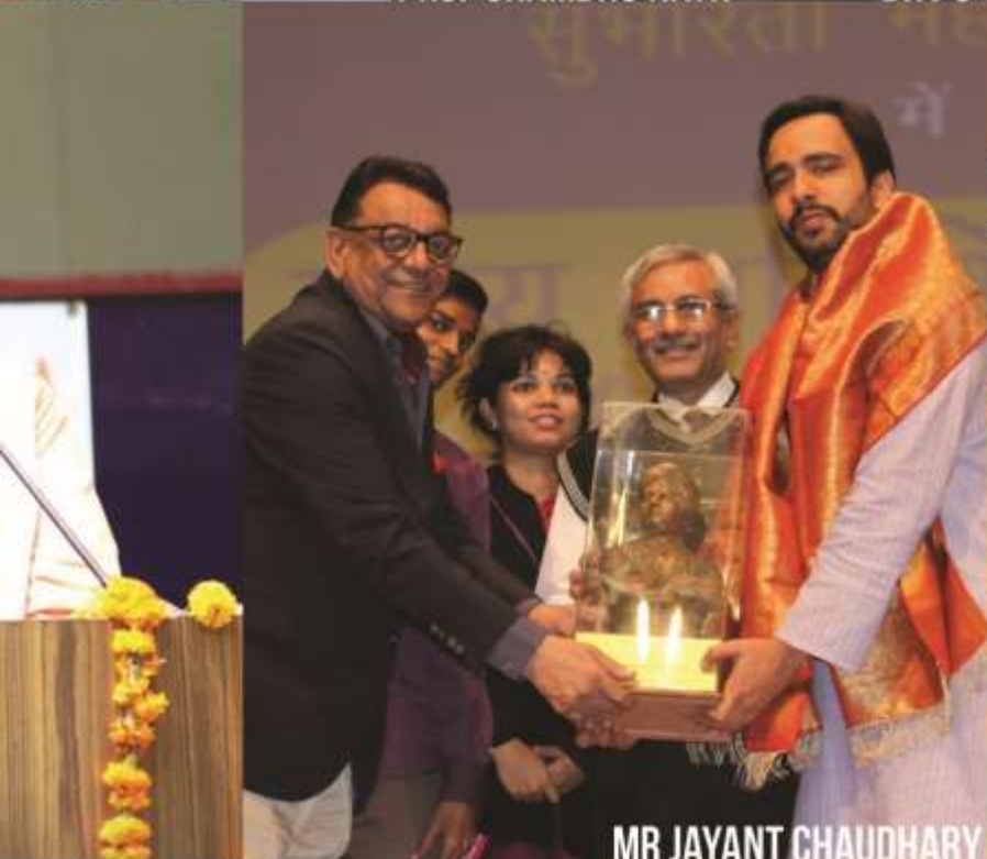
MR JAYANT CHAUDHARY