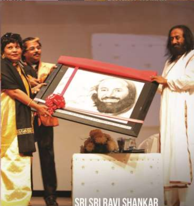
SRI SRI RAVI SHANKAR