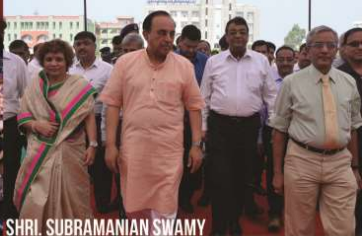
SHRI. SUBRAMANIAN SWAMY