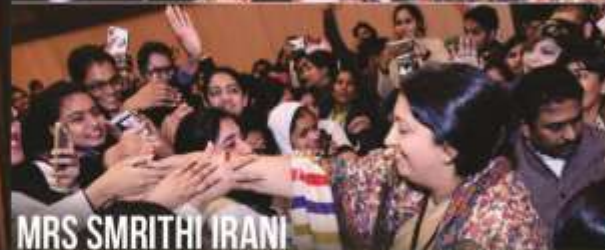
MRS SMRITHI IRANI